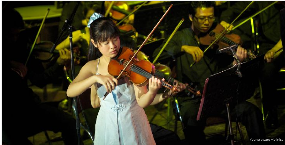
Young award violinist