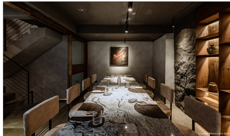
Chapter Restaurant dining