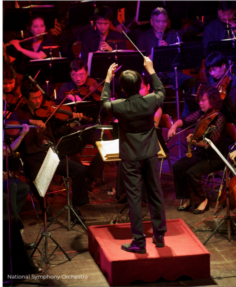
National Symphony Orchestra