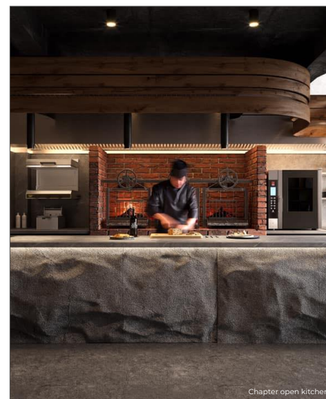
Chapter open kitchen