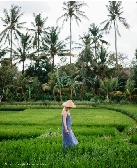
Walk through the rice fields