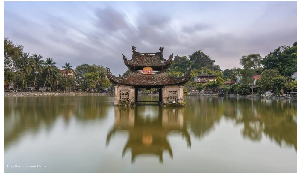
Thay Pagoda, near Hanoi