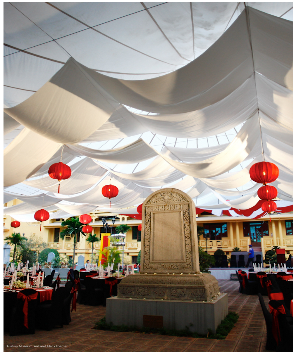
History Museum, red and black theme