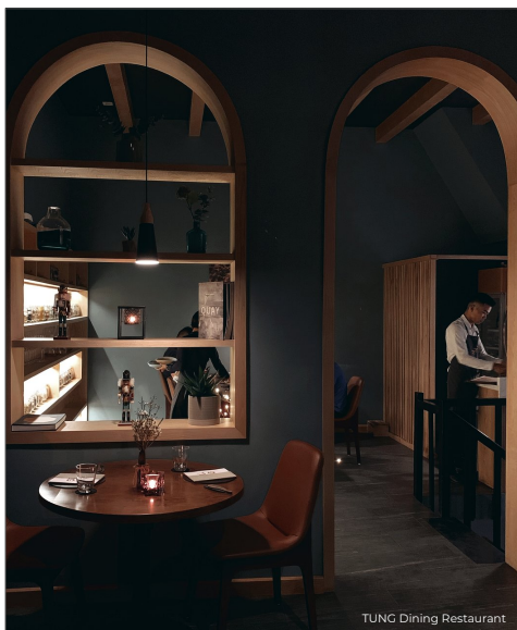
TUNG Dining Restaurant