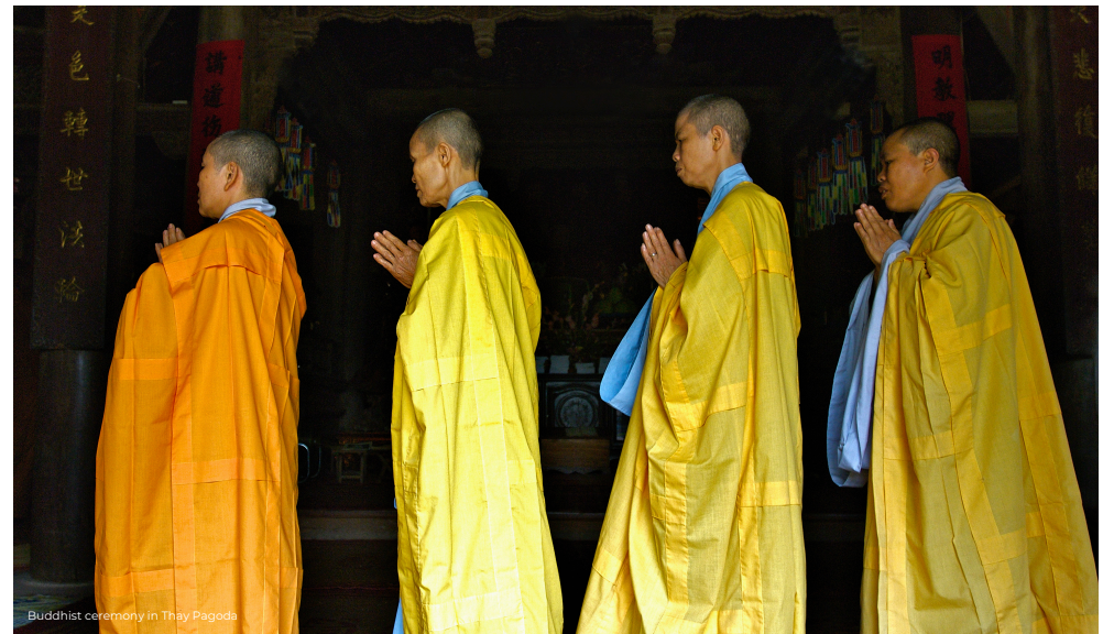
Buddhist ceremony in Thay Pagoda