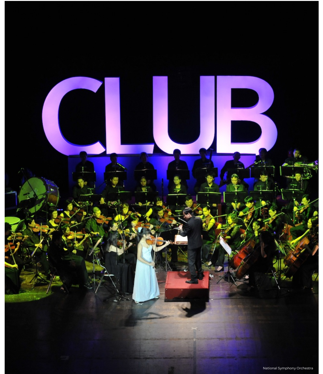
National Symphony Orchestra