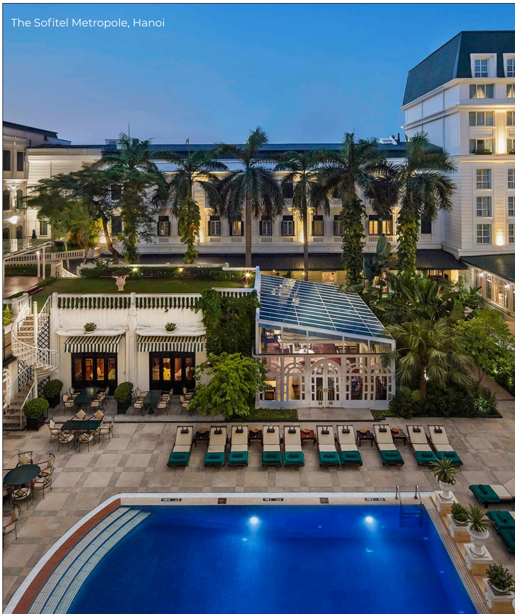
The Sofitel Metropole, Hanoi