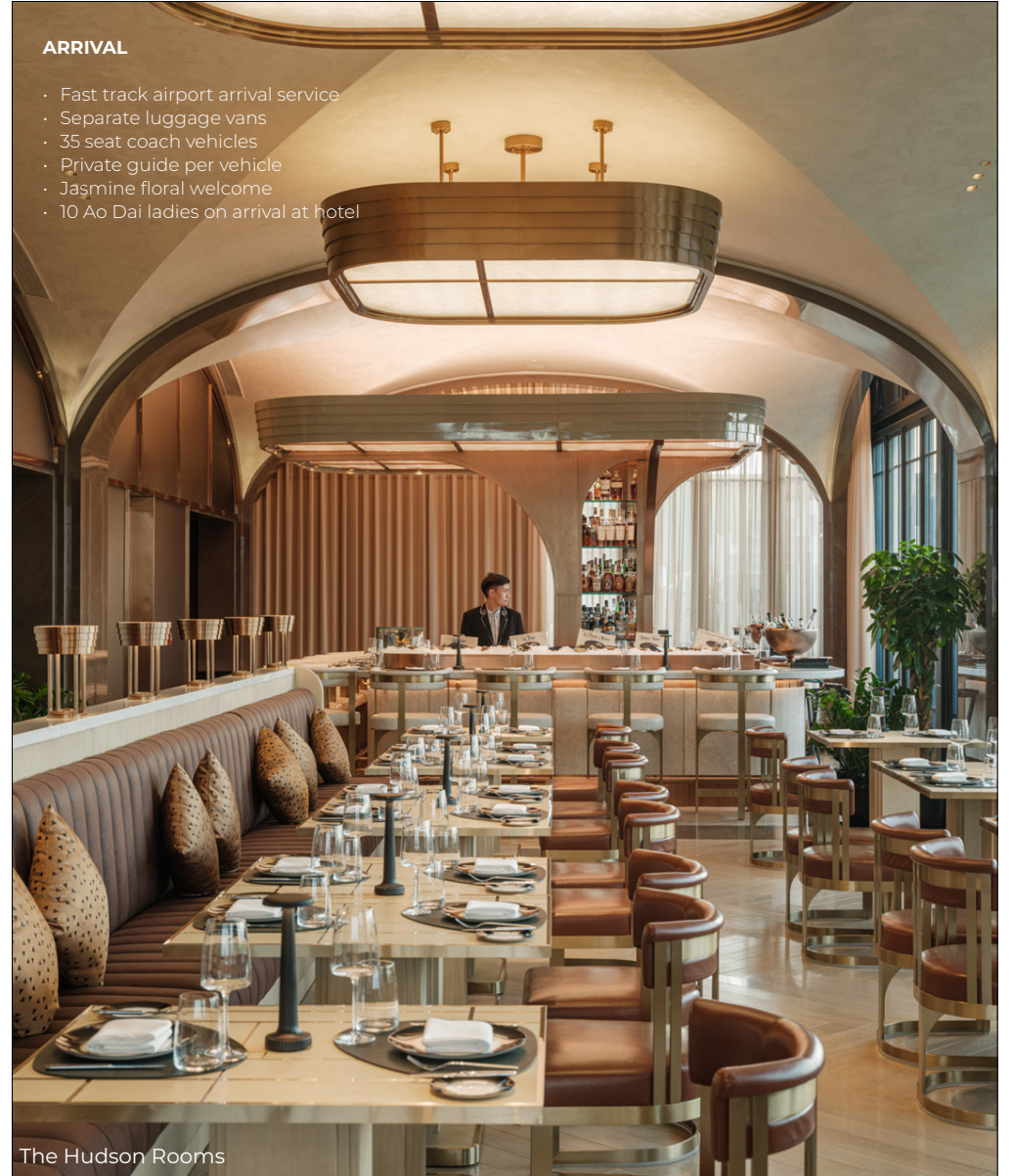
The Hudson Rooms