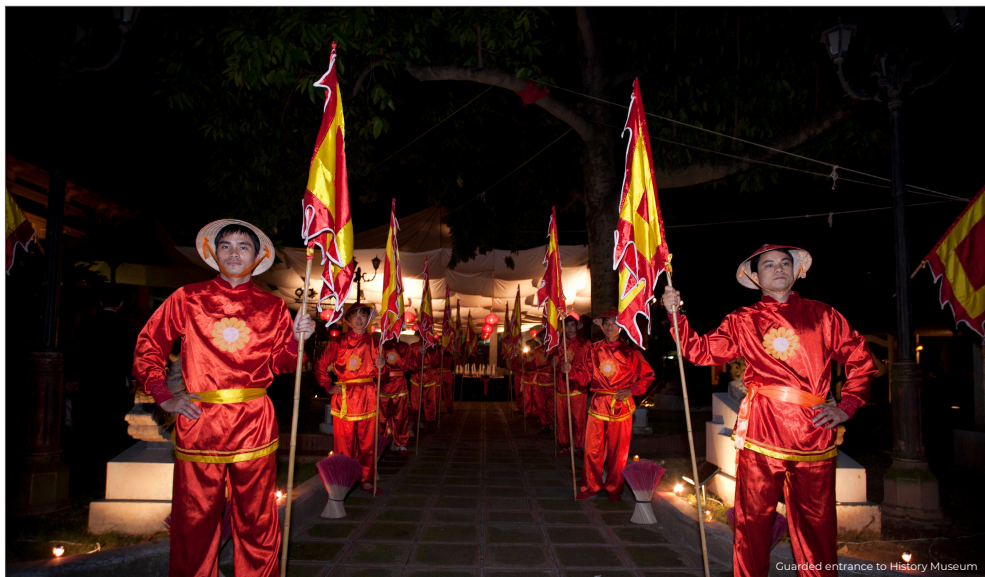
Guarded entrance to History Museum