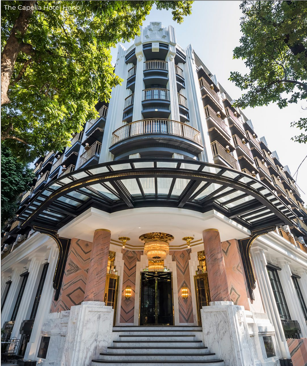
The Capella Hotel Hanoi