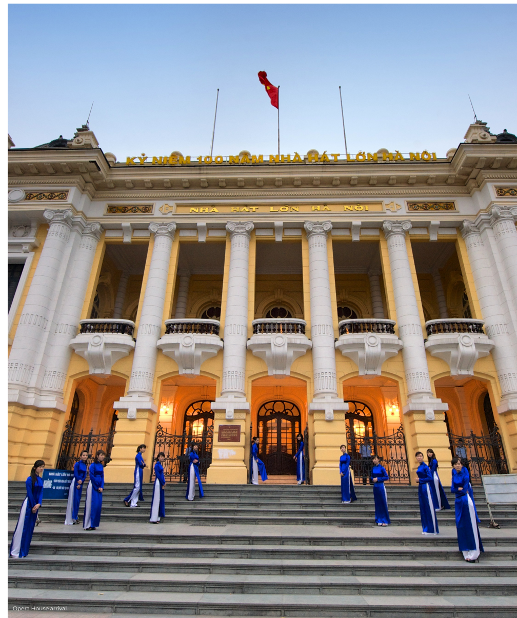
Opera House arrival