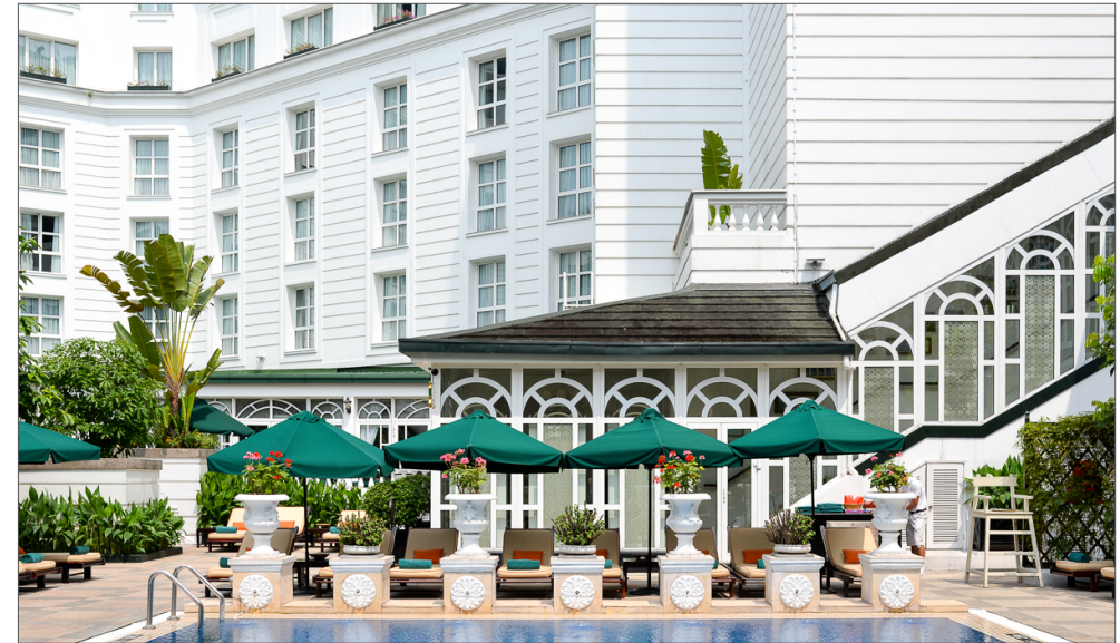
WELCOME EVENT AT SOFITEL METROPOLE HANOI