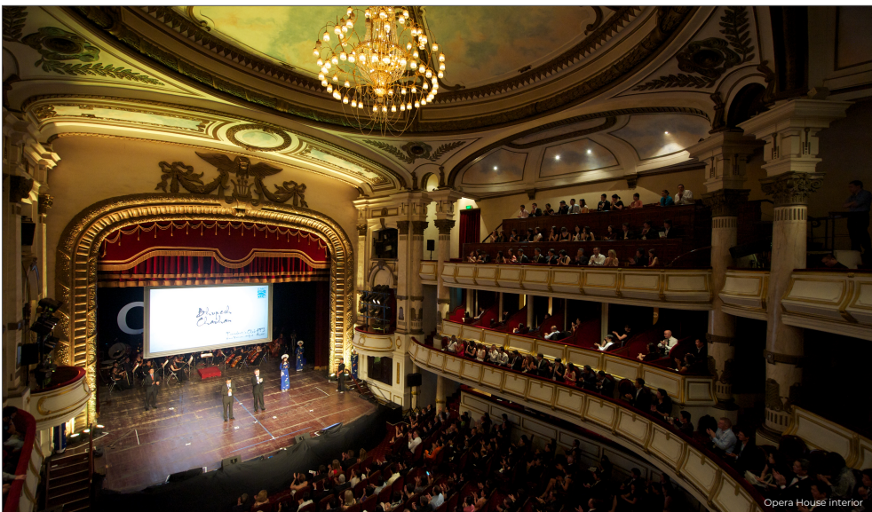
Opera House interior