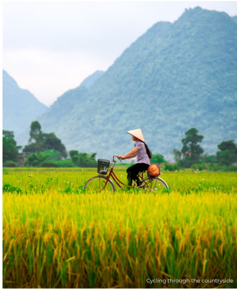
Cycling through the countryside